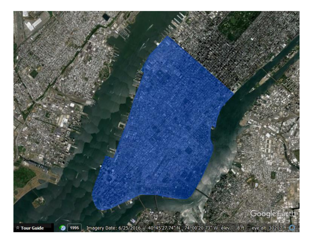
Figure 2. This analysis focuses on business interruption losses in buildings south of 42nd Street in New York City.

We focused our analysis on buildings south of 42nd Street in New York City (see Figure 2). Statistics for these buildings were gathered from data.ny.gov, which provides values for street address, building width and depth, market value, building class, number of stories in building, and detailed zone description (building use type) [45]. The data was obtained from the Condensed Assessed Value Roll created 2 September 2011. A manual scrubbing of the data was performed to account for multiple tenants residing within the same address. ArcMap from ArcGIS developed by Esri (Redlands, CA, USA) was used to geocode each property parcel. Property assessment data was acquired from the New York City Department of Finance 2010 census. As data was defined by building owner in the dataset, market values were summarized by building address to assess the complete value of each building. Building size was estimated using the data provided by the Department of Finance in building width and depth to compute area, and number of stories to calculate height and volume of the building [46].